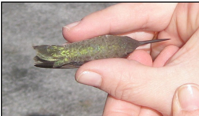
BCHU Back (Gary Lockerman)