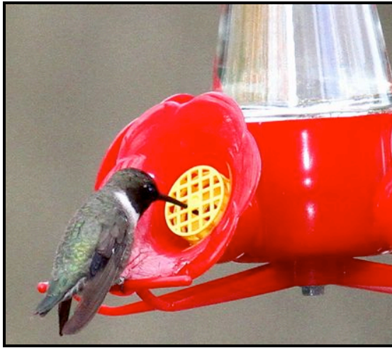
BCHU white necklace (Wayne Laubscher)

Weight and Fat Score: 3.39 grams is a good, healthy weight for a male Black-chinned Hummingbird. The fat score of 0+ indicated the bird was not entering into pre-migratory condition, since fat is usually laid on in significant amounts (fat score >3) before departure. The BCHU remained at the residence until XXXXXX .