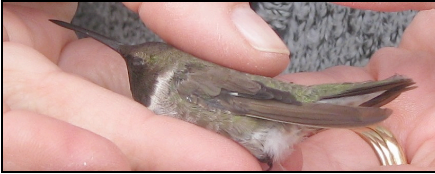
BCHU Side