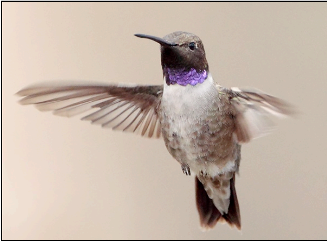
Black-chinned Hummingbird (Geoff Malosh)