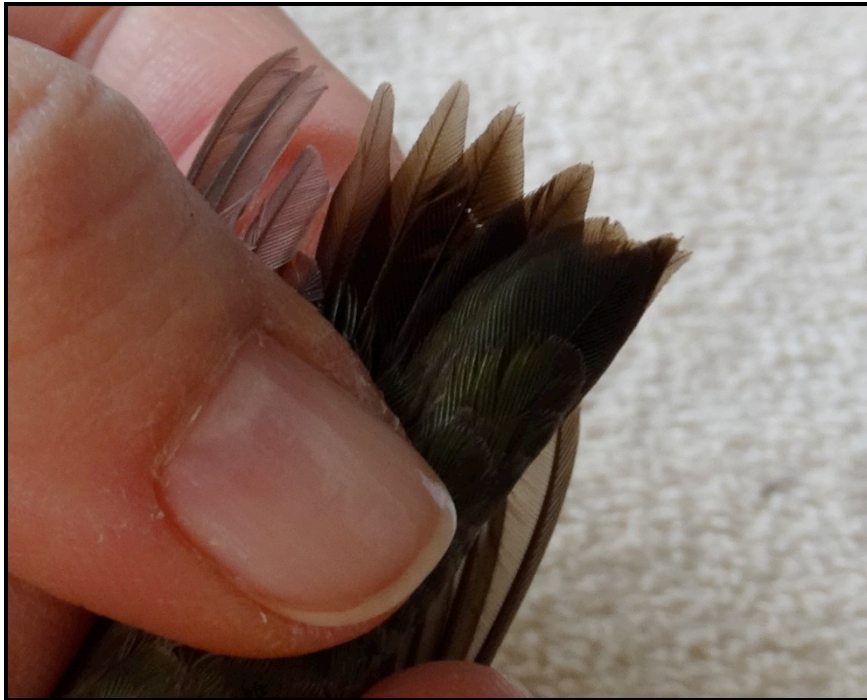
BCHU Tail feathers (Dale Gearhart)

As per Pyle (pages 134 and 138), adult BCHU will have narrower outer rectrices and often with a nipple at the end on r5 (outermost tail feather). This can be seen in the following photo.