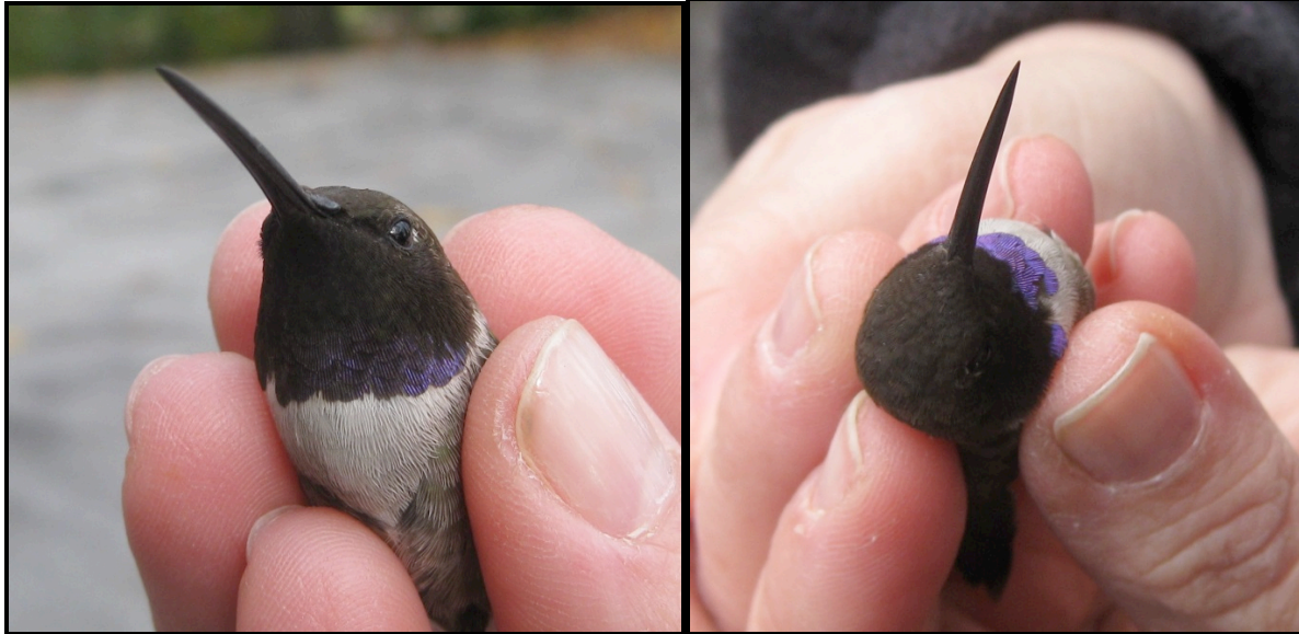
BCHU chin, gorget and throat (Sandy Lockerman)

Gorget feathers: The gorget was mostly black on the upper side closest to the chin, with the chin also being entirely black. Along the bottom of the gorget the feathers were iridescent amethyst purple, extending the entire width of the gorget. There were no iridescent feathers on the crown or nape. Two or three iridescent feathers were missing from the right side of the gorget.